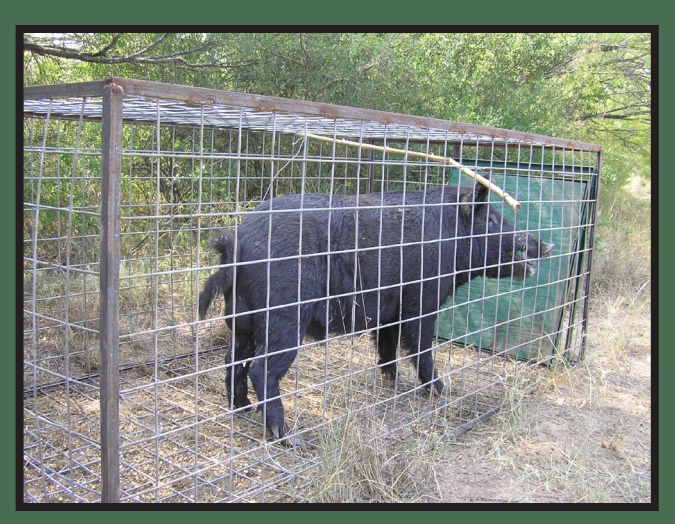
Figure 3. Feral hog captured in a box trap.