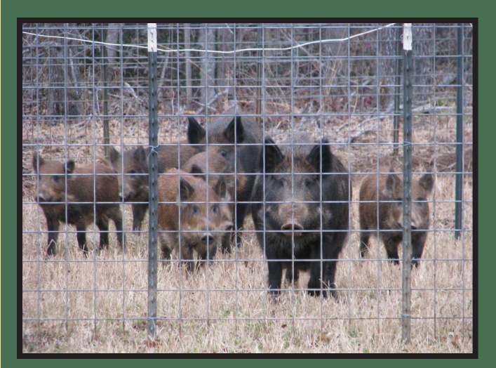
Figure 2. Feral hogs captured in a corral trap.