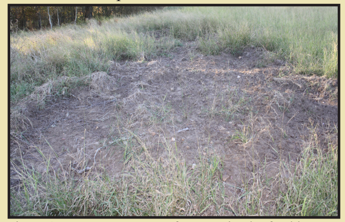
Figure 1. Damage to pasture from rooting by feral hogs.

Landowners or their agents are allowed to kill feral hogs on their property without a hunting license if feral hogs are causing damage. However, any landowner that plans to trap or snare hogs should have a valid Texas hunting license, since these activities could affect other wildlife species.