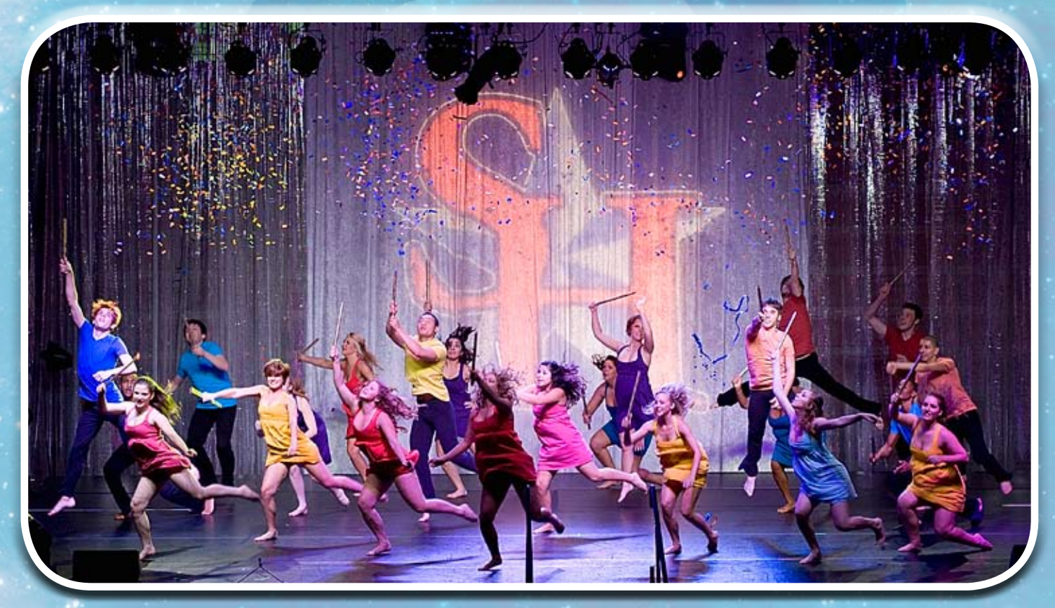
Students with the SHSU dance program perform during the opening of the Celebrate the Vision event.