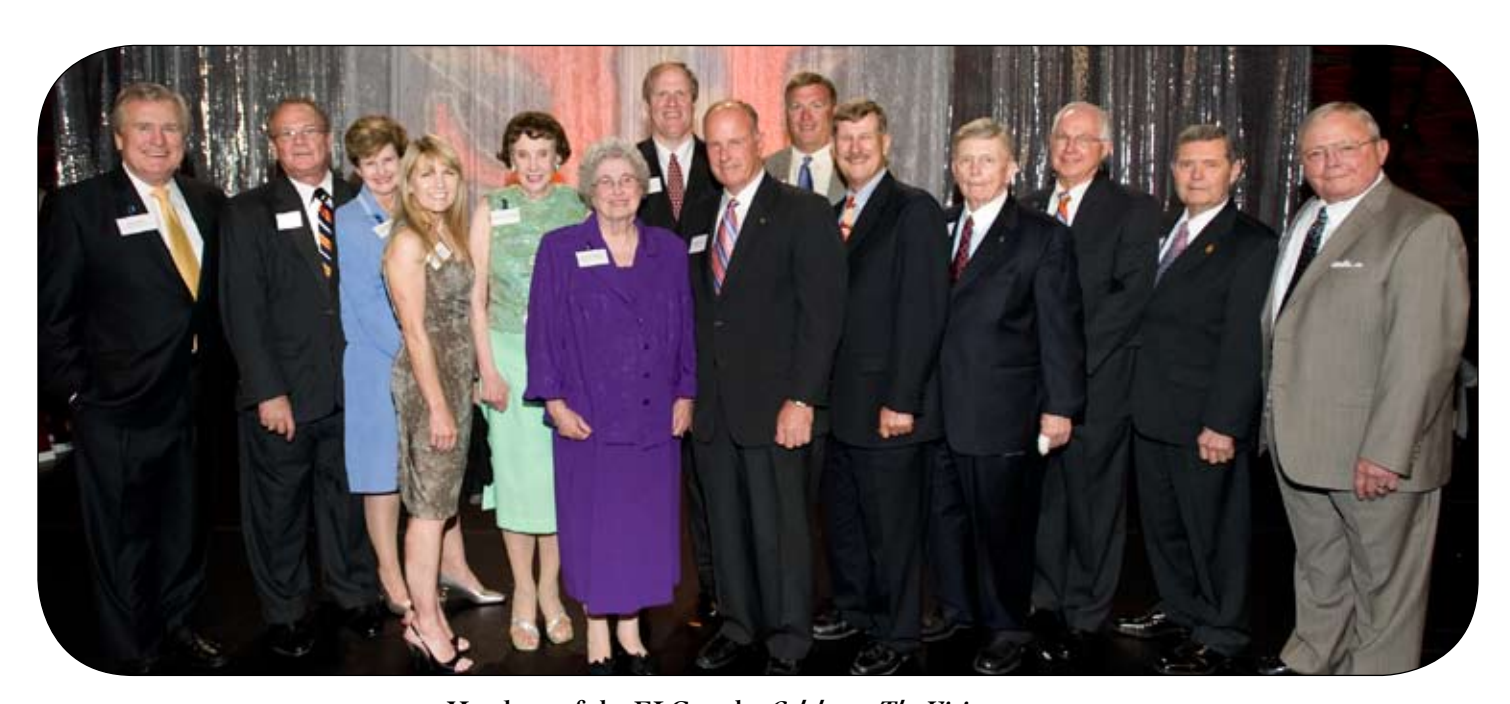
Members of the ELC at the Celebrate The Vision event.

Sam Houston State University Office of University Advancement Box 2537 Huntsville, TX 77341-2537