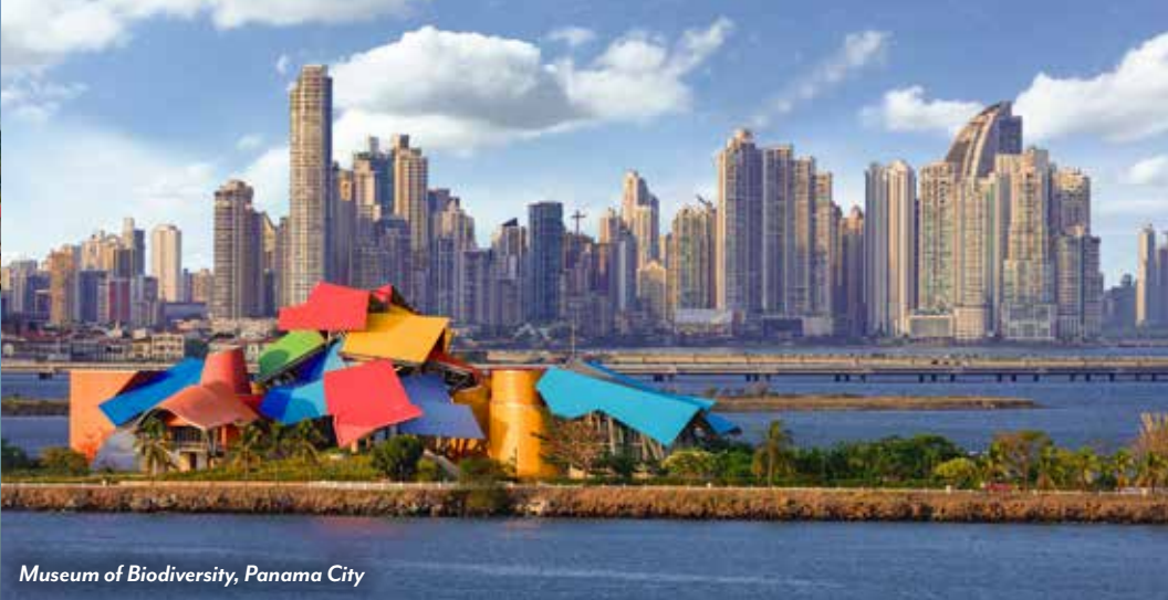
Museum of Biodiversity, Panama City