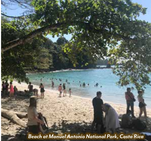
Beach at Manuel Antonio National Park, Costa Rica

Explore the island on a guided beach walk or a snorkeling adventure. (B,L,D)