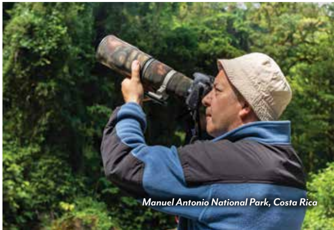
Manuel Antonio National Park, Costa Rica