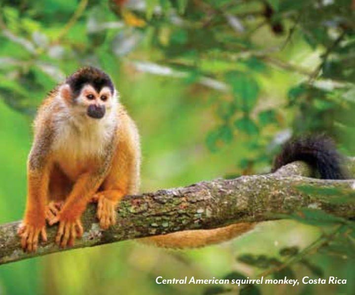
Central American squirrel monkey, Costa Rica