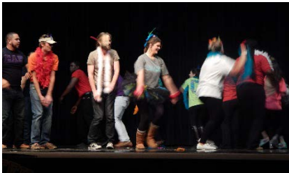
Team Brazil performs the theme song from the movie Rio to take 2 nd place in the Greek Sing competition