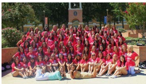
Alpha Omicron Pi

Founding: January 2, 1897 at Barnard College of Columbia University – New York Motto: "Exceed the Expectation" Color: Cardinal National Philanthropy: Arthritis research and the American Juvenile Arthritis Organization