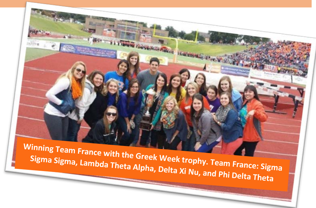
Winning Team France with the Greek Week trophy. Team France: Sigma Sigma, Lambda Theta Alpha, Delta Xi Nu, and Phi Delta Theta

Greek Sing. Greek Sing is a tradition in Greek life on many other campuses. Each team selected songs from their respective team countries and did a spectacular lip syncing performance