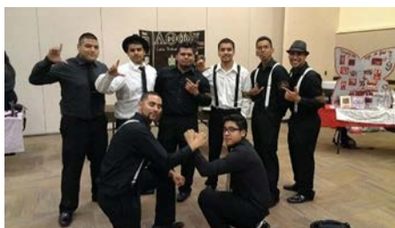
Lambda Theta Phi