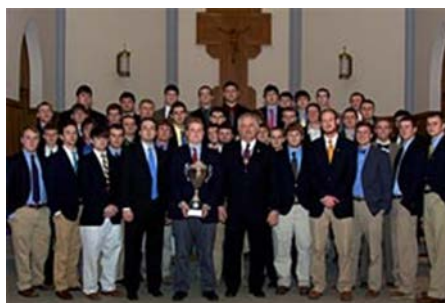
Kappa Alpha Order

Founding: December 21, 1865 at Washington and Lee University - Virginia Motto: "Excellence is Our Aim" Color: Crimson and Old Gold National Philanthropy: Muscular Dystrophy Association