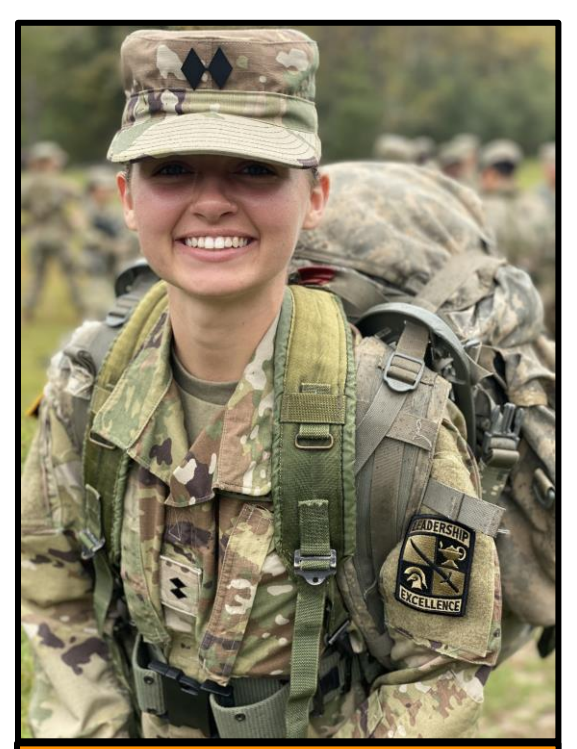
BC Loerwald oversees battalion training at lab.