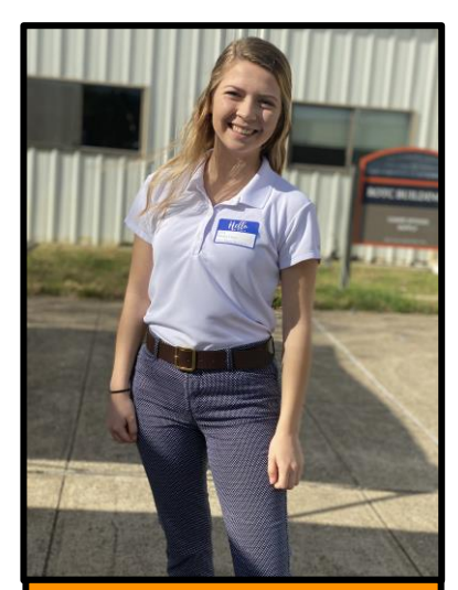
"Branch Day provides an understanding of each branch you will eventually select. Even if you are set on a certain one, it is important to understand other branches."