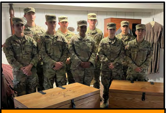
Cadets continuing the tradition of guarding the SHSU Graduation Rings.