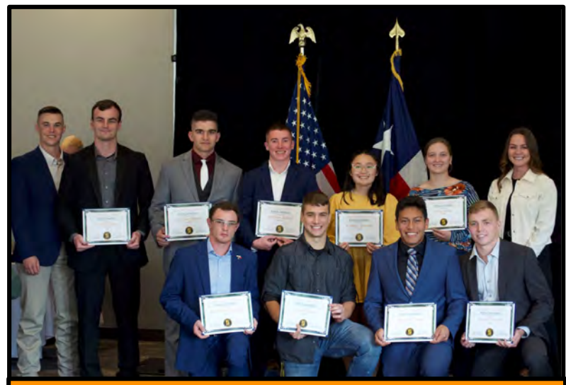
MSI Cadets receiving Perfect Attendance Awards for their dedication.