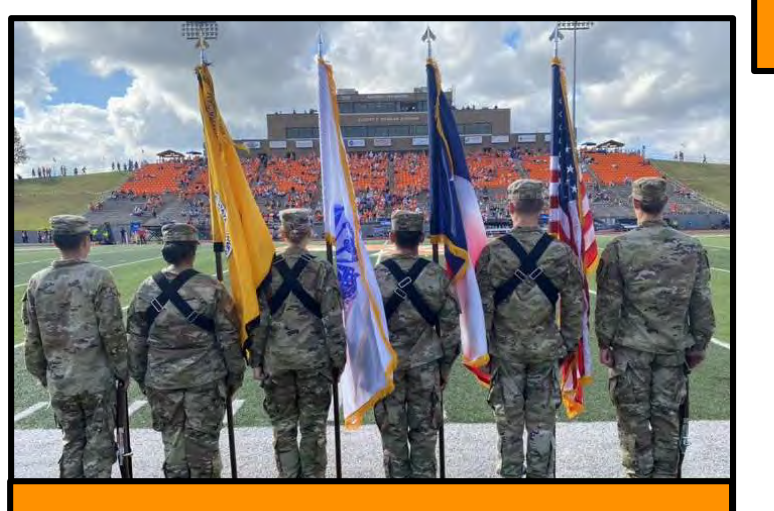
Color Guard performing as SHSU goes into the playoffs.