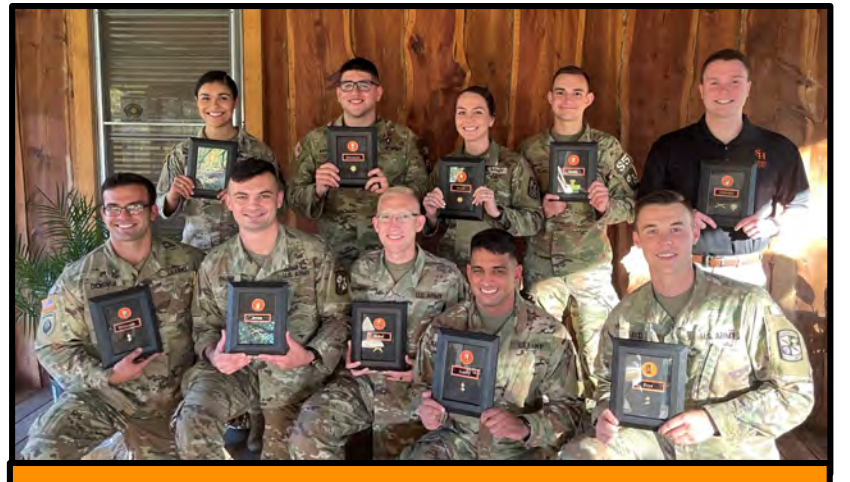
MSIV Cadets receiving their Active-Duty Branches.