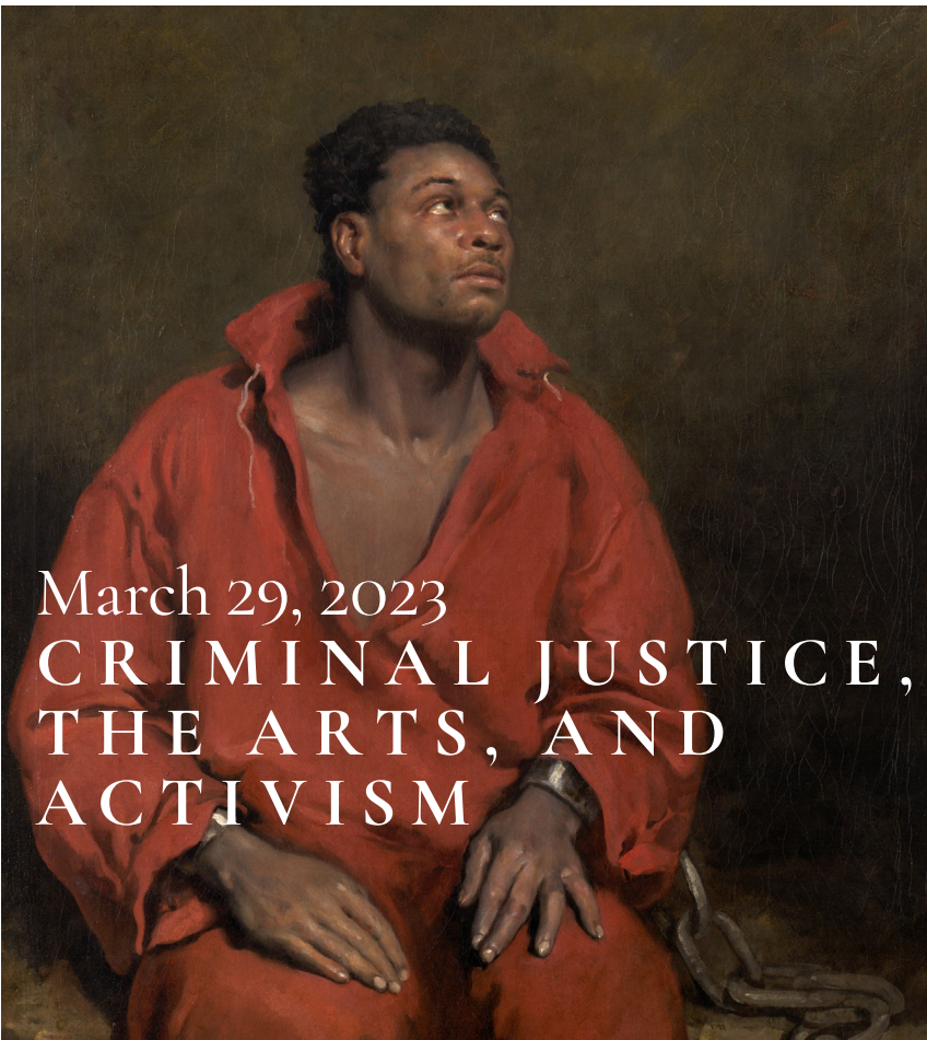
John Philip Simpson, The Captive Slave , 1827, oil on canvas, (2008.188).