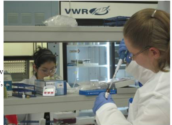
Two forensic scientists analyzing samples in the Toxicology lab at the new SHSU-RCL

agencies but will not be limited to that client base. The laboratory will serve law enforcement, the respective district attorneys, and the defense bar.