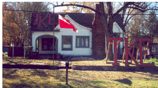
Teke House: Alumni Weekend