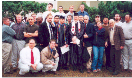
Graduation: December 2001