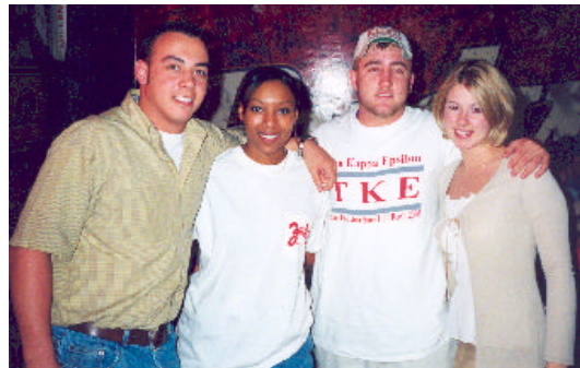
Undergraduates at Zach's Bar and Grill with Alpha Chi Omega.