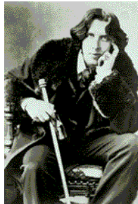
Oscar Wilde was born in Dublin, Ireland