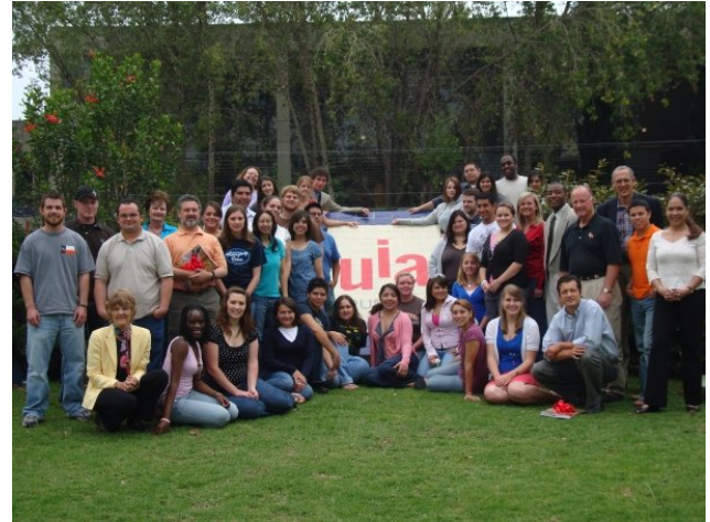
Puebla Summer Camp 2008

When we decided to publish a newsletter, we knew space would be a premium because of all the catching up we had to do, and we wondered if we would “downsize” later on. I’m pleased to report that so many things are happening that we’re still having problems getting them all in.