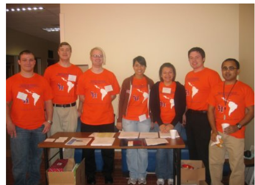
Students participating at the event

Research articles selected from the presentations at the conference will be published in a special issue of the Journal of Business Strategies (a journal published semi-annually by the Gibson D. Lewis Center for Business Research and Economic Development) in Spring 2009.