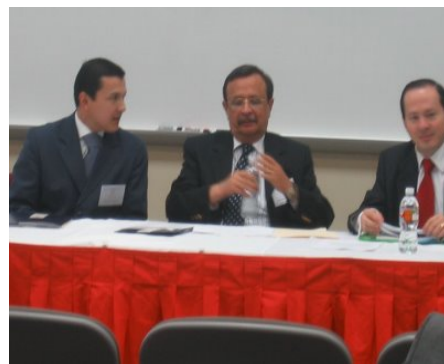
Consuls of Colombia, Mexico and Costa Rica

The Consul Generals of Mexico and Costa Rica and the Consul of Colombia (based in Houston) participated in a panel discussion on challenges and opportunities of free trade in Latin America.