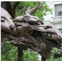
12 Heads Do the Talking for a Silenced Artist