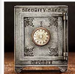
Sales of Home Safes Surge