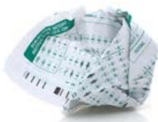
A Better Medical School Admissions Test