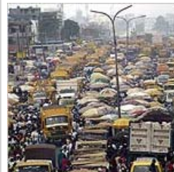
Room for Debate: How to Support 10 Billion People