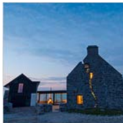
On Location | Respect for a Scottish Ruin