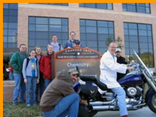
Who knew physical chemistry could be so much fun?