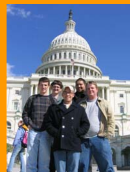
The SHSU Trumpet Ensemble March 2006 in Washington D.C.