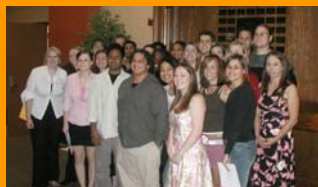
CHM students at the awards ceremony on April 18th.