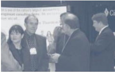
COBA faculty at the Spring Business Career Fair

Since 1999 the College of Business Administration has sponsored a business career fair at least once a year and most recently twice each year. After the terrorist attacks of September 11 th , on-campus recruiting efforts were expected to decline but the College of Business Administration enjoyed excellent attendance for both its Fall and its Spring Business Career Fairs.