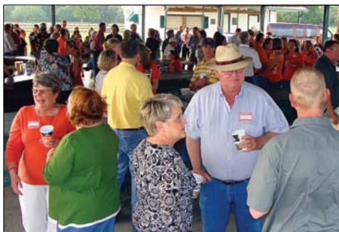
Alumni and friends gather at the Welcome Hall