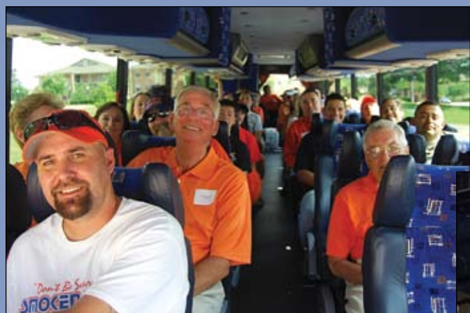
More than 95 alumni and friends took the chartered buses from Huntsville to Minute Maid Park for the Astros game.

More than 330 Alumni and Friends attended the annual SHSU Night at Minute Maid Park on June 10.