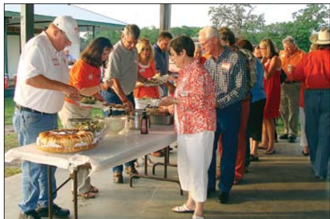
Everyone dined on barbecue by Schovajsa Catering