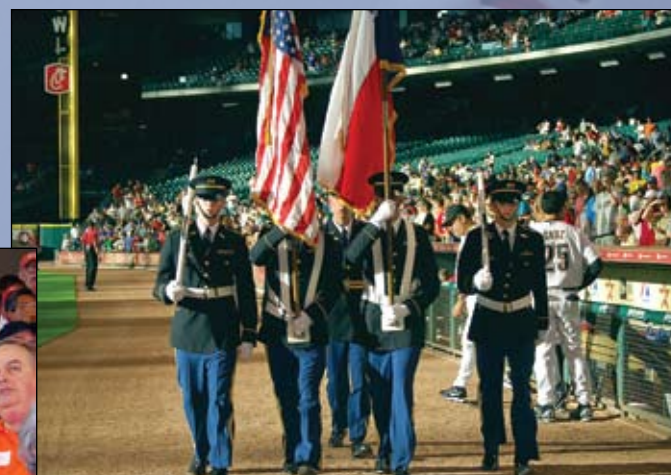
The SHSU ROTC Color Guard presented the colors before the Astros game.