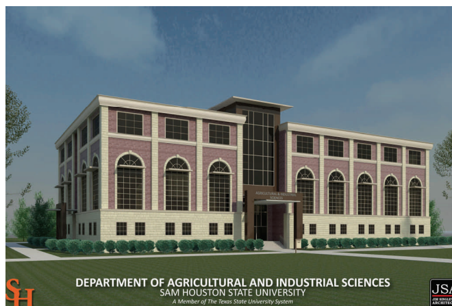
Proposed Agricultural and Industrial Sciences Academic Building