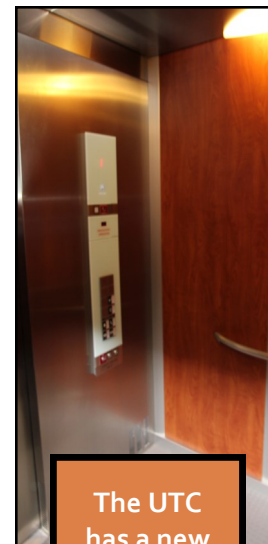
The UTC has a new elevator!