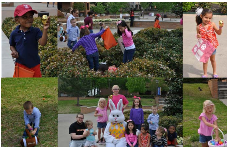
Yummy treats and great friends; what more could you ask for?