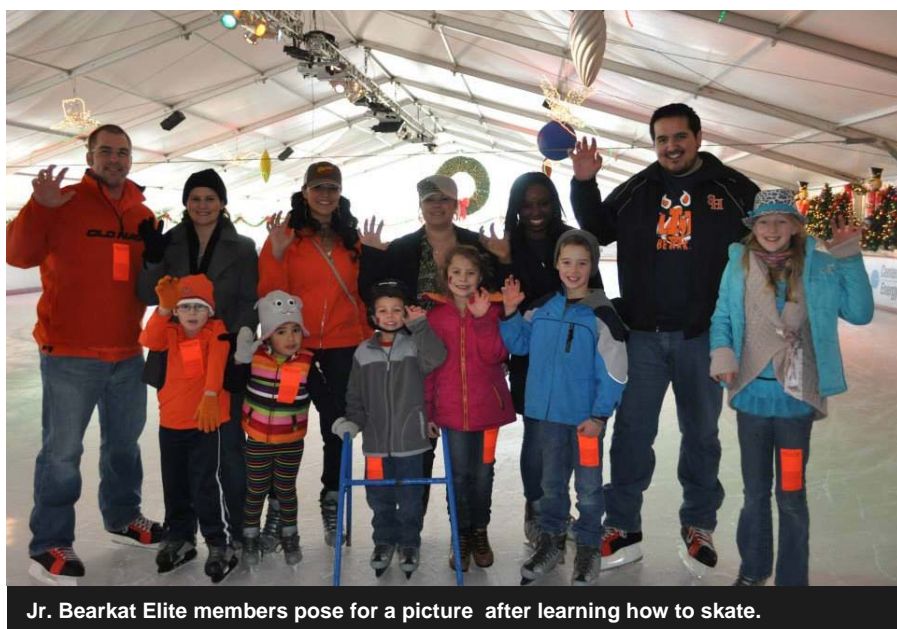
Jr. Bearkat Elite members pose for a picture after learning how to skate.