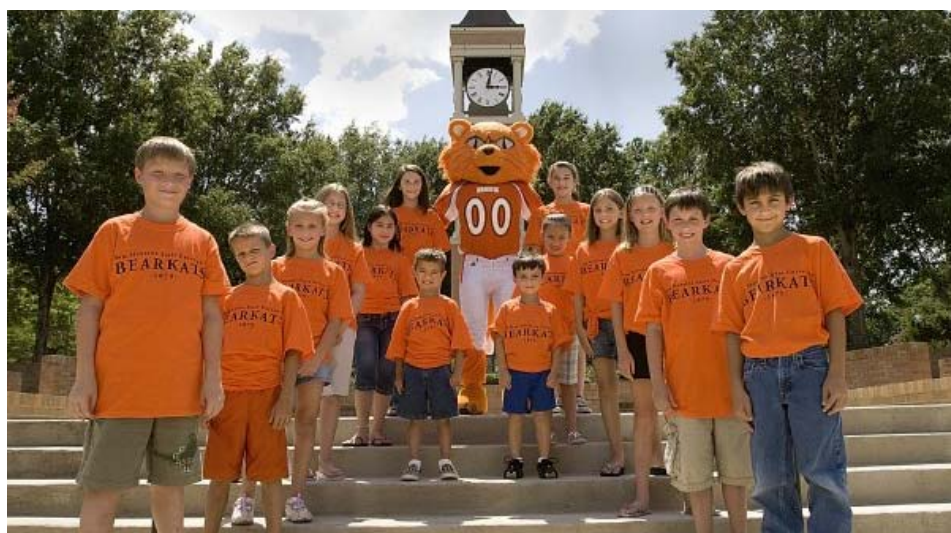
Jr. Bearkats pose with Sammy after a fun day on campus.