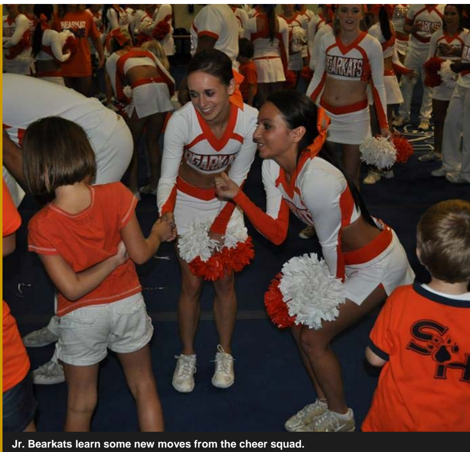
Jr. Bearkats learn some new moves from the cheer squad.