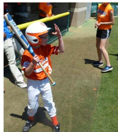
WOW! she knocked it out of the park!