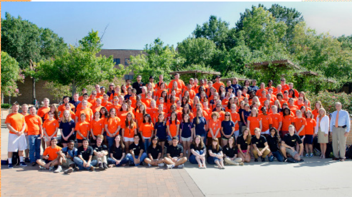
(Group Photo Sept. 2012)