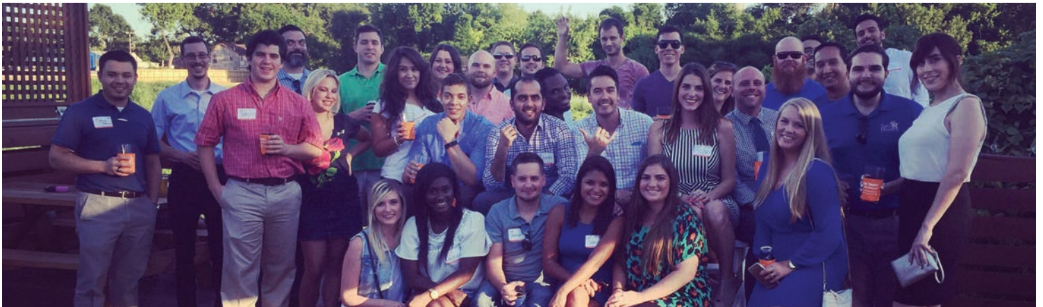
▲ The Greater Houston Young Alumni & Friends Club met at the Raven Tower for their monthly happy Hour on July 21st. Join their Facebook group ( facebook.com/SHSUYoungAlumni/ ) to learn about future events!

SHSU Alumni Association Box 2022 Huntsville, TX 77341-2022