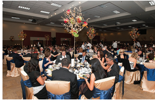
Over 300 guests attend the 2012 gala to honor this year's award recipients.