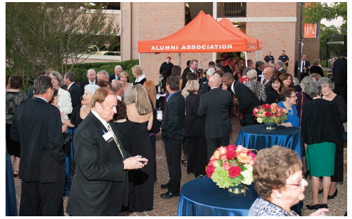
▲ Alumni and friends enjoy the beautiful weather during the pre-gala reception held outside of the SHSU Lowman Student Center.