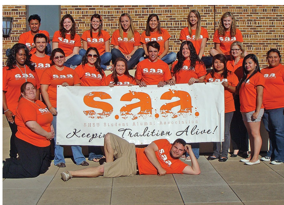
(Left) 2010-11 SAA group photo. (Right) SAA members collected more than 450 cans of food for the local mission. (Below) SAA members pass out carnations and visit with seniors at a local nursing home.

Anyone wishing to sponsor the SAA team during the Relay for Life may do so by contacting the Alumni Relations Office at 800.283.7478.