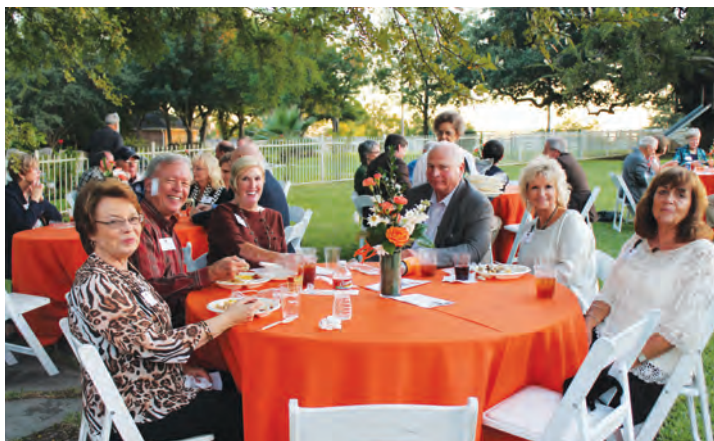
▲ Close to 100 Alumni attended the Waco Area Alumni & Friends Club Kick-Off Reception, October 17, 2013 to support the newly formed club. For more information, please contact SHSUwacoarealumi@yahoo.com .