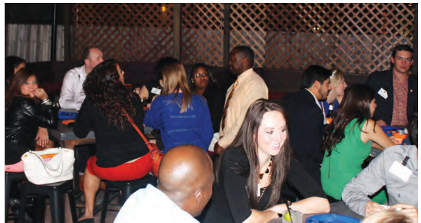
▲ Over 60 young alumni attended the Young Alumni & Friends Club Kick-Off Reception, October 24, 2013 at the Capital Bar - Midtown in Houston to support the newly formed club. For more information, please contact SHSUyoungalumni@gmail.com .