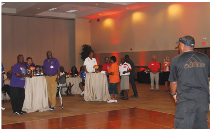
▲ Sam Houston State University Alumni Association, The Office of the Vice President for Student Services, and the Black Alumni and Friends Club hosted a Homecoming Reception on October 12 in the Lowman Center Ballroom immediately following the game.