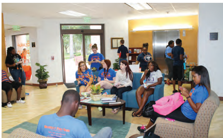
▲ The Student Alumni Association kicked off the fall semester on September 3 with a party in the John R. Ragsdale Alumni and Visitor Center to introduce the new officers and welcome students back to campus.