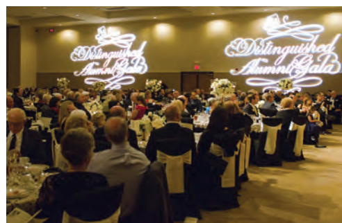
▲ Over 300 guests attend the 2013 gala to honor this year's award recipients.