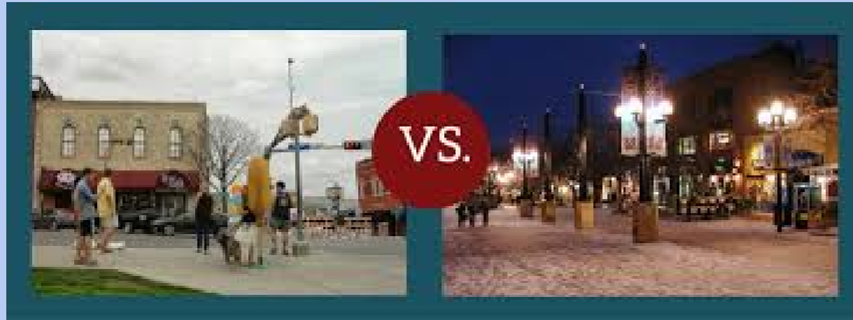
Struggling Main Street vs. Healthy Main Street Program