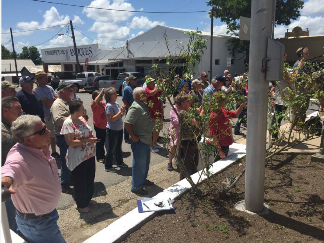
Real feel for the professional field