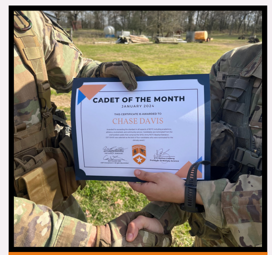
"There is nothing more important than your friends in the program. I may have gotten Cadet of the Month, but I wouldn't be where I am without them."