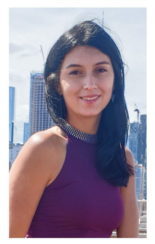
Introducing Bearkat Lucine!!