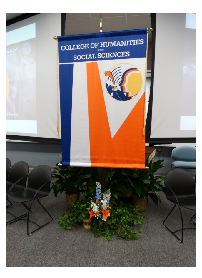
Spring 2013 CHSS Graduation Awards Ceremony