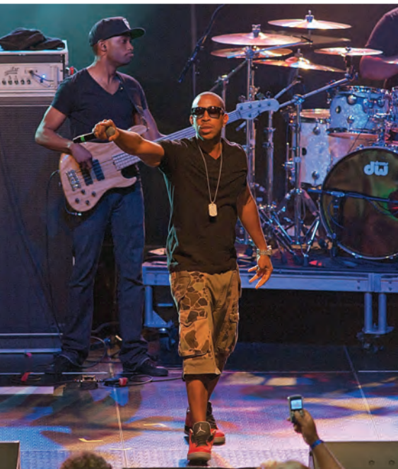
Grammy-award winning performer Ludacris was the headliner for this year's third annual Sammpalooza, which also included the All-American Rejects and Eve 6.