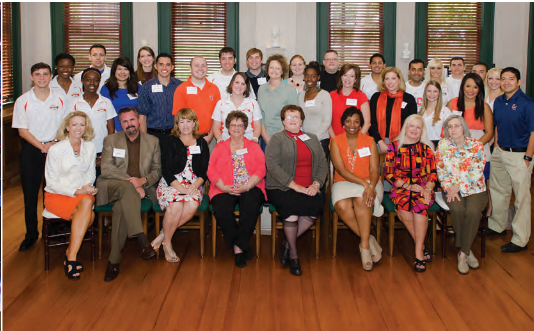
Approximately 25 former Orange Keys, representing every generation of the Bearkat ambassadors, connected with current members during the first Orange Keys reunion during homecoming week. The group was founded in 1959 as a service organization for women and became co-ed in 1982.