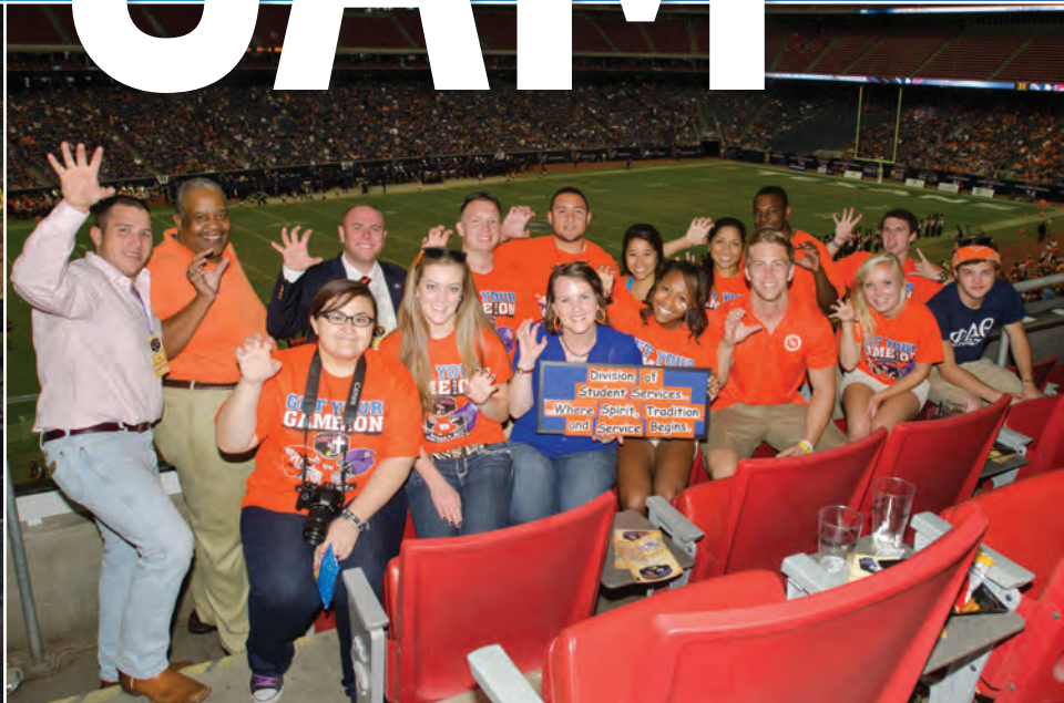
Football "fanatics" won some of the best seats in the house for the Battle of the Piney Woods in October through the Student Services division -sponsored spirit contest. To participate, students submitted photos and captions highlighting their Bearkat spirit.