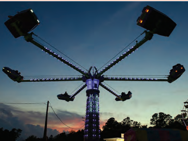
The annual SamJam Carnival held at Holleman Field was among the many activities students were able to participate in throughout Homecoming Week.