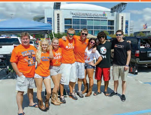
Tailgaters hang out before joining the 26,185 fans inside Reliant Stadium who attended this year's Battle of the Piney Woods and witnessed SHSU defeat SFA for the second consecutive year.