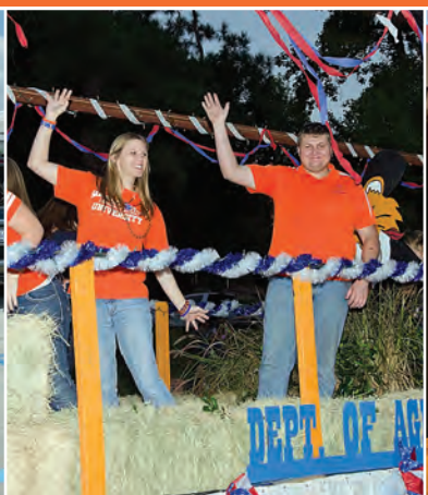
Members of the SHSU community always look forward to the annual Homecoming Parade.