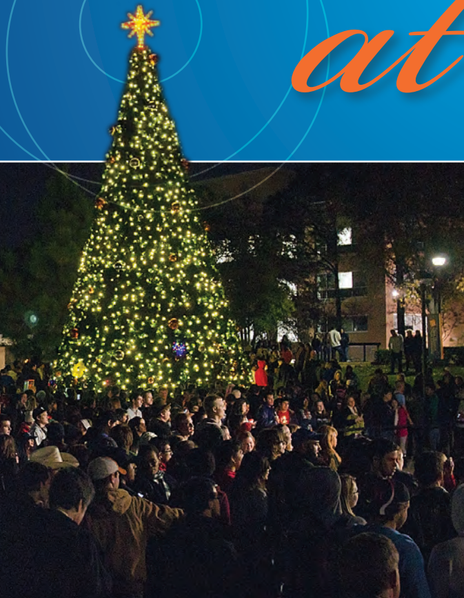
Students gathered to celebrate the spirit of the holiday season during the 92 nd annual Tree of Light ceremony on Nov. 27