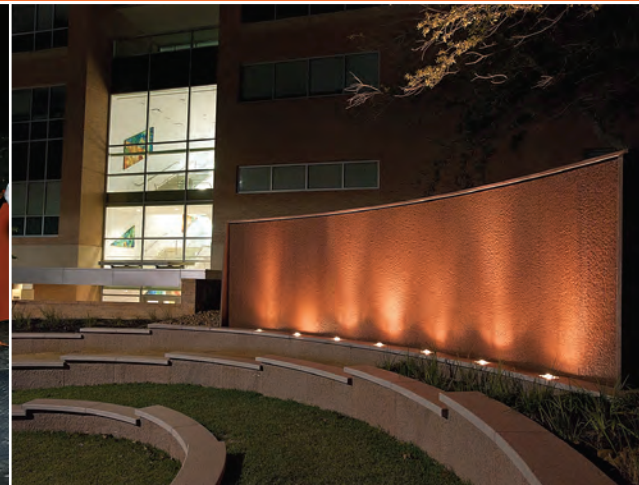
The CHSS Art Plaza and Outdoor Classroom creates a beautiful space behind the College of Humanities and Social Sciences Building. The college formally dedicated the plaza in November.