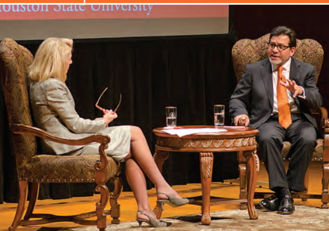
Former U.S. Attorney General Alberto Gonzales discussed his life and career during the President's Speaker Series presentation in November.