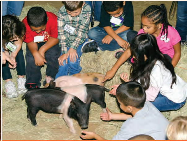
The Block and Bridle animal science club hosted a "Children's Barnyard" for local elementary students.